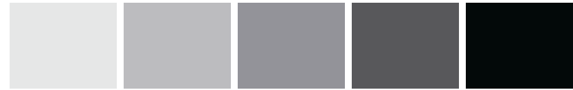
2000-N SSG 27 3500-N SSG 28 5502-B SSG 29 7502-B 9500-N NS 106