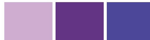
2030-R50B NS 303 4040-R50B NS 202 4040-R70B