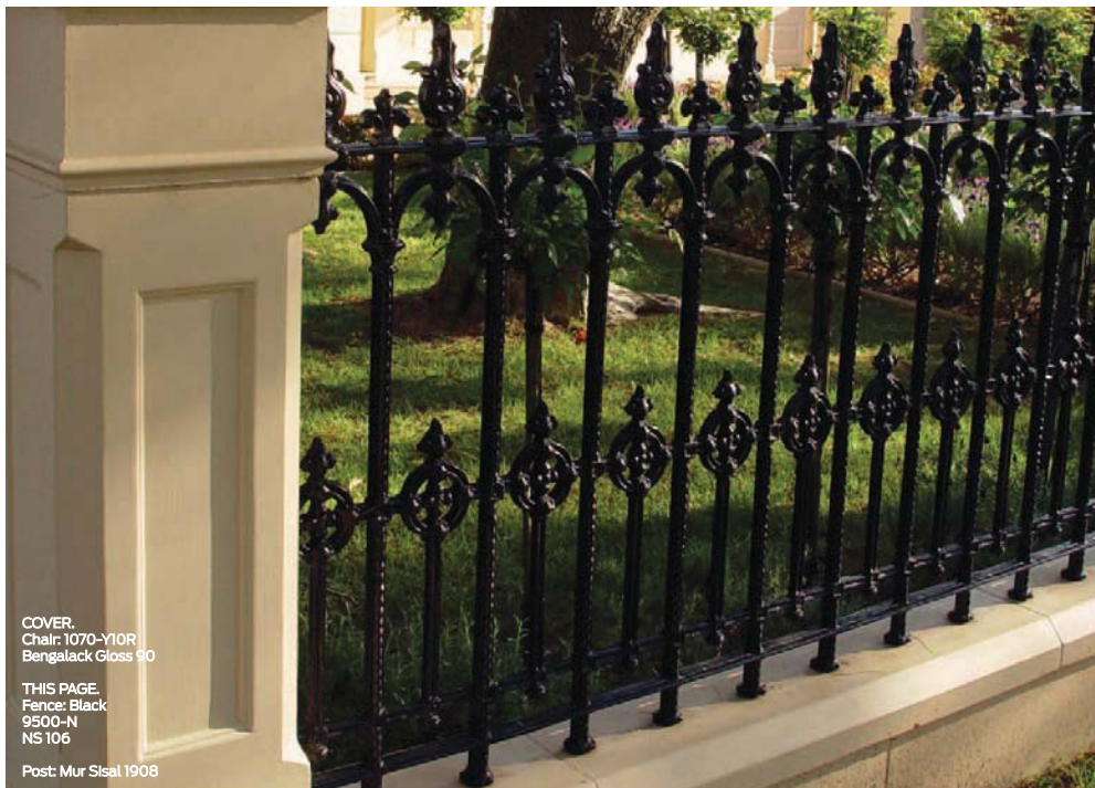
COVER. Chair: 1070-Y10R Bengalack Gloss 90