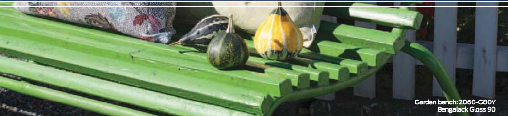
Garden bench: 2060-G80Y Bengalack Gloss 90

STEEL IRON WROUGHT IRON CAST IRON GALVANISED STEEL ALUMINIUM