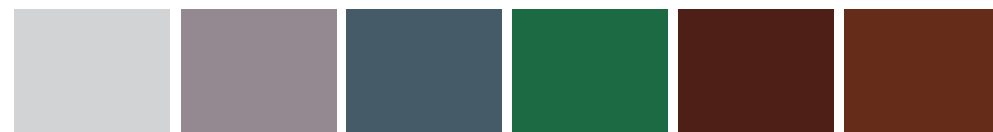
377 Metal grey 386 Zinc 340 Grey 342 Green 331 Reddish brown 2008 Ferro