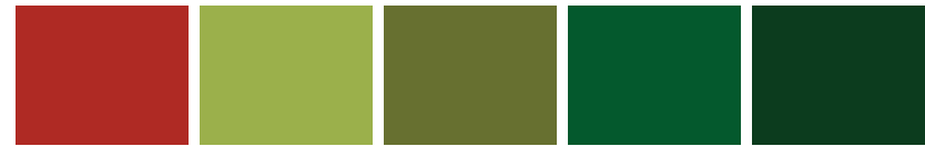
3060-Y80R SSG 30 2060-G80Y 5030-G90Y NS 309 5144-G23Y RAL 6002 05 Leaf green 6820-G17Y

For best results in colour rendition and quality ensure that all coatings are mixed using Jotun's Multicolour tinting system. The colours shown in this colour card may vary from the actual colours available due to a number of reasons including the limitations of the printing process as well as different lighting conditions. Lustre and foundation can also have an impact on the colour's aspect.