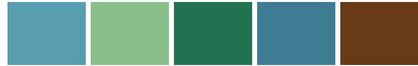
3030-B10G SSG 25 3020-G30Y SSG 21 5020-G30Y SSG 22 5020-B10G SSG 26 6020-Y50R SSG 31